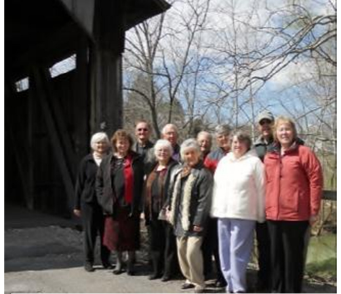
Team pictured by covered bridge

This group has been excellent working together with a wonderful atmosphere and great fellowship. These four couples had spent three months working